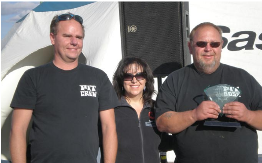
Grand Champions: Pigasus!