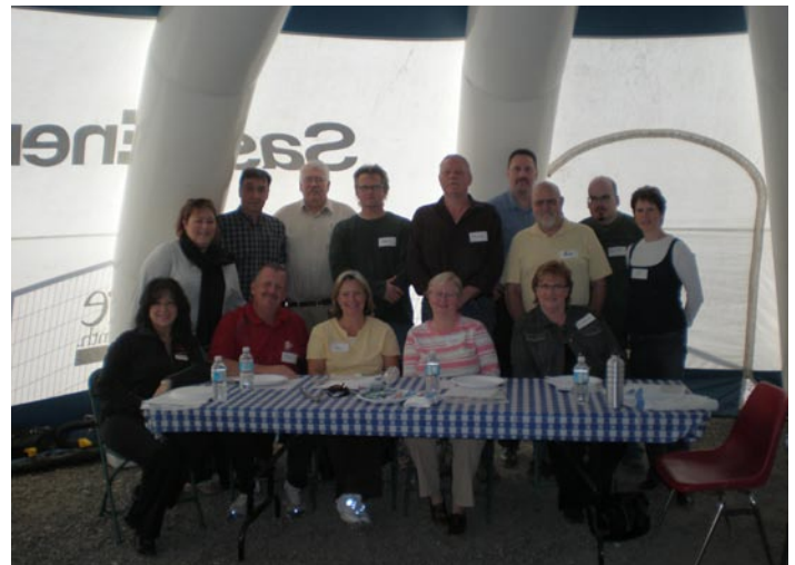
Hard working Judges of Pile of Bones