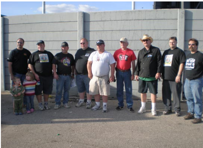
Pile of Bones Competitors